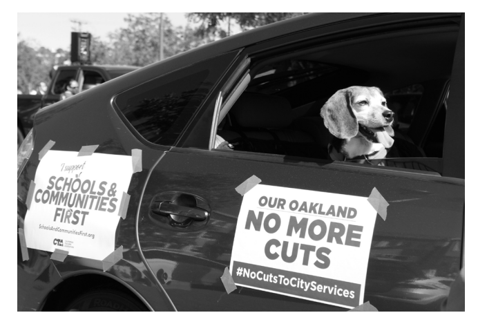
City of Oakland Car Caravan, May 26