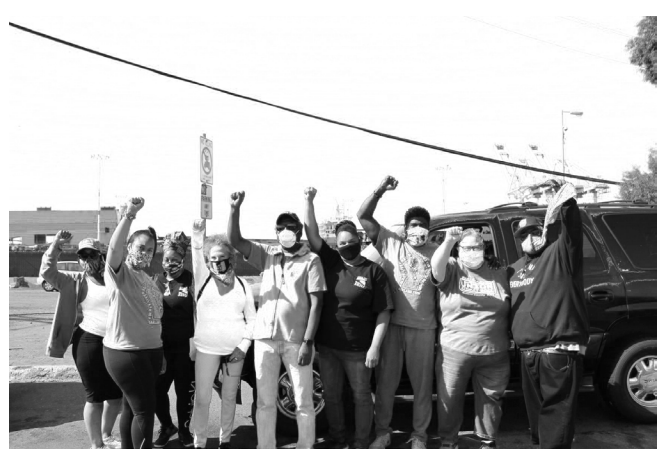
Juneteenth Solidarity March (ILWU Port Shutdown), June 19